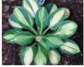
Holy Mouse Ears

Earth Right products have been used on our plants!