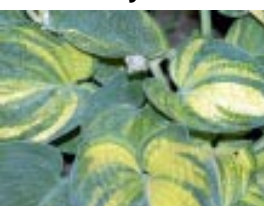
Ice Age Trail